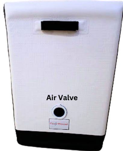
CHAIR BACK VIEW