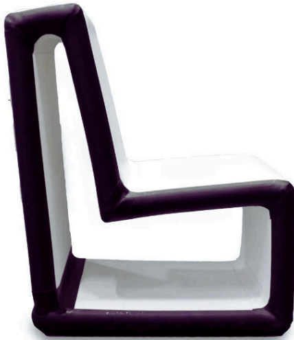
CHAIR SIDE VIEW